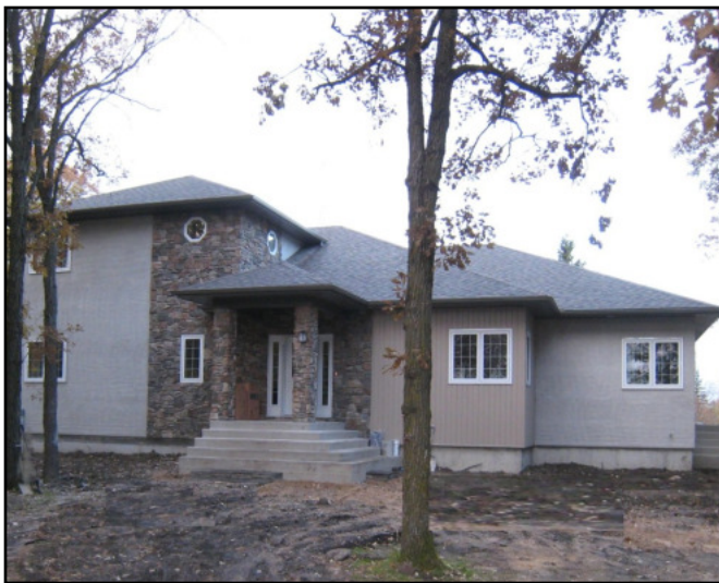
Light of the Prairies, Lorette, MB

TO BE ALIVE IN THIS BEAUTIFUL, SELF- ORGANIZING UNIVERSE -- TO PARTICIPATE IN THE DANCE OF LIFE WITH SENSES TO PERCEIVE IT, LUNGS THAT BREATHE IT, ORGANS THAT DRAW NOURISHMENT FROM IT -- IS A WONDER BEYOND WORDS. JOANNA MACY